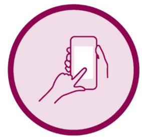
DOWNLOAD COVIDSAFE APP

**IMPORTANT** Some services may be cancelled if a high risk presents itself to either the client or staff member. Supreme Community Care will continue to provide services to clients with high care or life-threatening needs, these services times may be altered depending available staff.